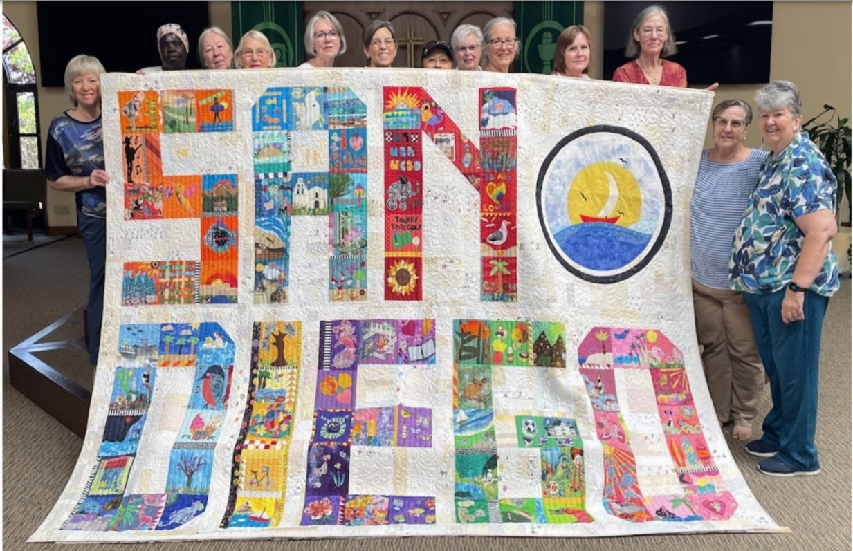
Seaside Quilters Guild members with the quilt Pacific Beach residents helped make earlier this year.