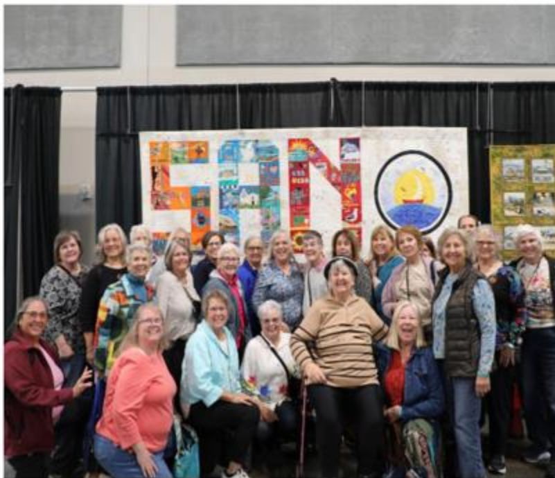
Members of the Seaside Quilters Guild who made this amazing community quilt that hung in the 2025 ROAD2CA show.

March is Women's History Month , and we at Road to California Quilter's Conference & Showcase are celebrating the creativity, resilience, and artistry of women throughout history.